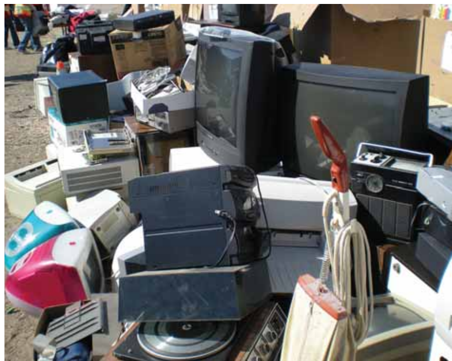
DPW held a one day electronics recycling collection event in March. The event was sponsored by Samsung and was overwhelmingly successful, resulting in the collection of over 248,000 pounds of electronics.